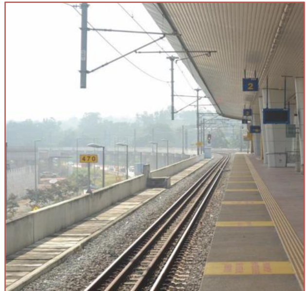
Sungai Gadut Station Platform