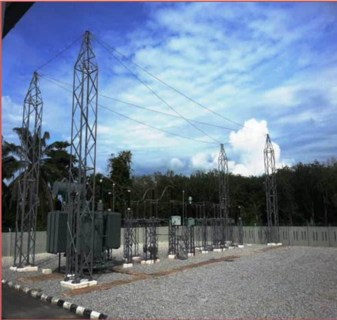
Batang Melaka FS 132 kV Bay

Ironcon has conducted Simulation studies of Voltage Change, Phase change and Harmonics on Incoming 132 kV grid of TNB and designed the optimized substations. The efficient protection system with switchgears and sectioning ensures the reliability of the system.