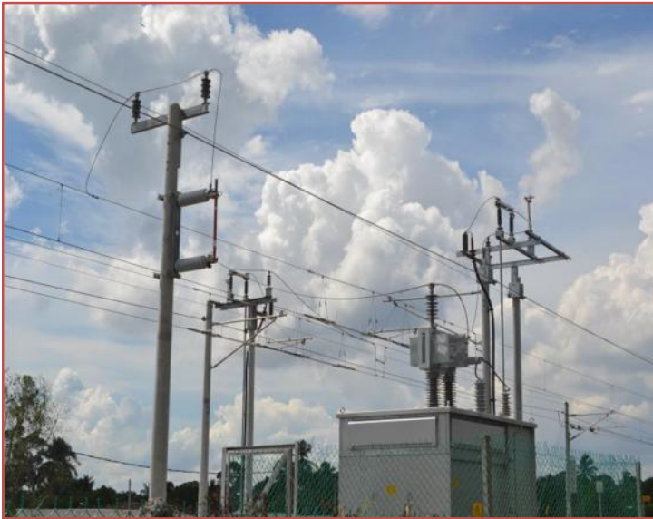
Harmonic Damper at Rembau

Harmonic Dampers (Low pass filter of 1 st order) are introduced for the first time in the history of Malaysian Railways. The filters are designed to avoid the line resonance and consequent faults to make the system highly reliable. Ircon has given the utmost priority to give a system with minimal maintenance requirement. The RC type filters are lower in costs and moderate in energy consumption.