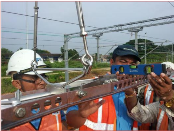
Neutral Section Checking at Rembau

The maintenance is being done with standard maintenance schedule. This includes monthly, quarterly, half yearly and annual inspection of Catenary in isolations/outages.