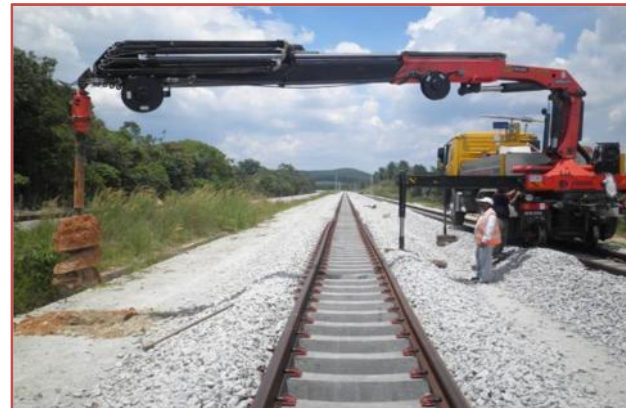
OCS Pole Concreting

With a firm QA/QC procedures the conformity of the deliverables are given the utmost importance. The Execution of OCS work was done on the fixed coordinate plans to enhance the productivity and making possible the parallel execution of OCS and Track Works.