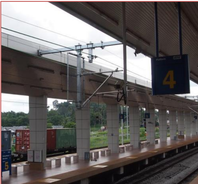
Gemas Station Platform

With in-house design team, the OCS has been designed considering the architectural beauty