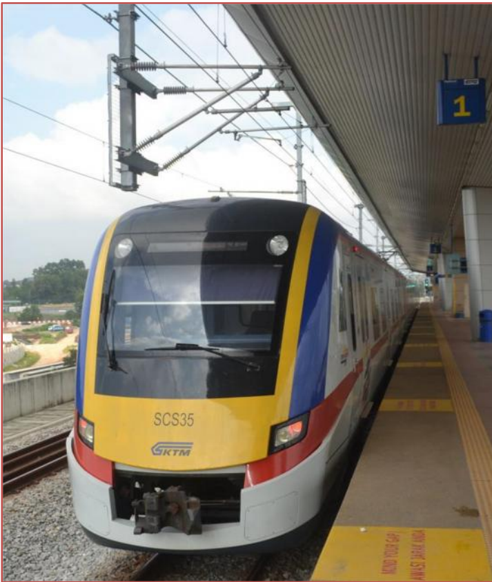
Sungai Gadut Station

SGEDT, Malaysia OCS is designed for the maximum speed of 160 KMPH and to meet the KTMB operation calendar of year 2037. The design has been based on the pantograph dynamics of the Catenary system at the maximum speed and incorporating the European standards to derive the various OCS parameters.