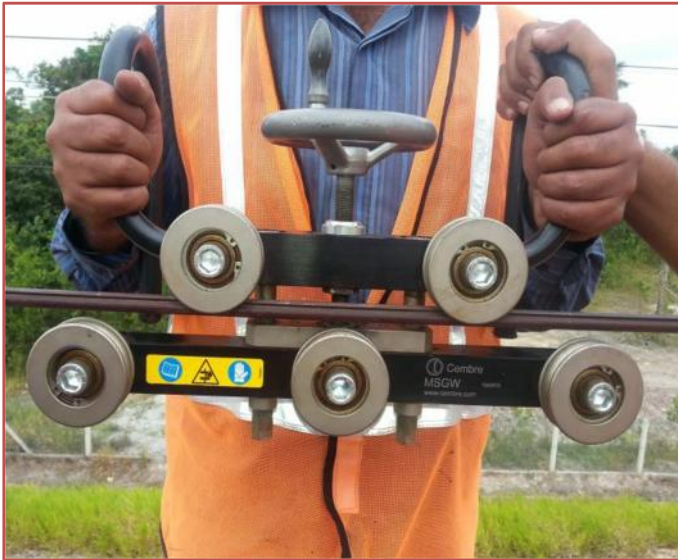
Spring type kink Remover, to smoothen the Contact Wire profile

After successful commissioning of the Seremban - Gemas project, the maintenance works is in progress.