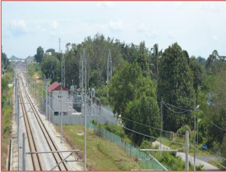
Aerial view of Rembau FS

The need for efficient, eco-friendly and well-integrated public transport and mass rapid transit is greater and more urgent than ever. In the past 36 years, Ircon is executing the railway electrification projects in India and abroad to meet the increasing demands of commutation.